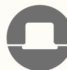
CUT IN SPEAKER